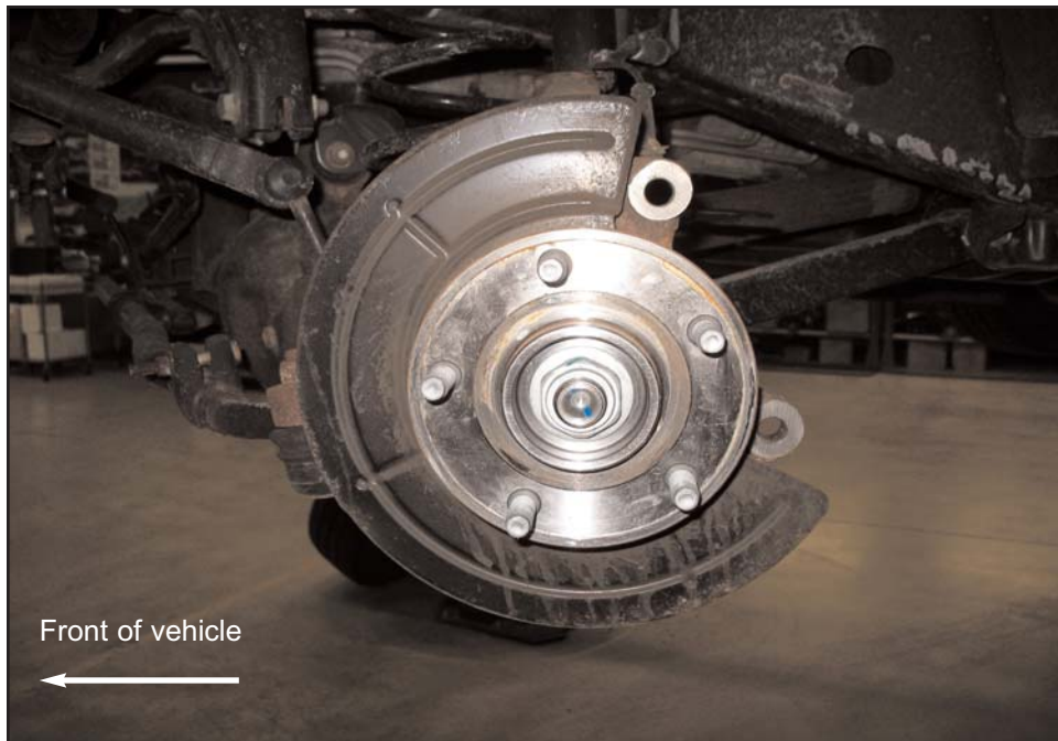
Hub with stock brakes removed.