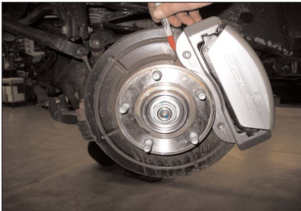
Install the caliper assembly and mark the splash shield for trimming.