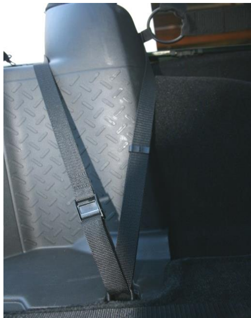
(Inside view looking out.)

Adjust and tighten nets all around. Slip the excess strap through the slip keepers.