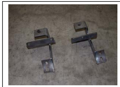
Fig 2 Driver side brackets