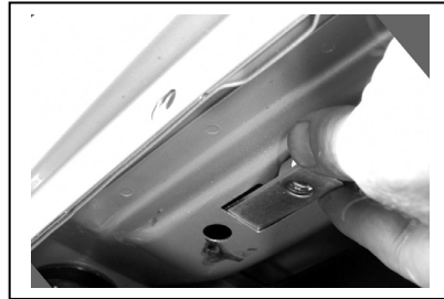
Fig 4 Driver side front shown