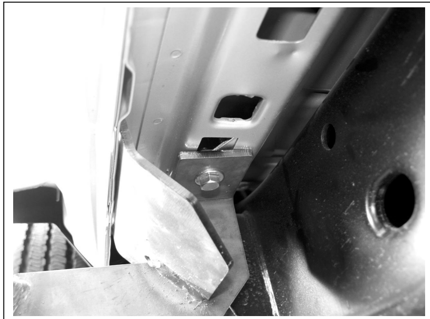
Fig 5 driver side front bracket shown