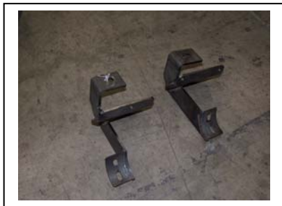
Fig 1 Passenger side brackets