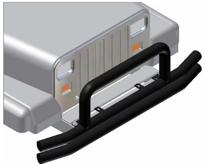
Figure 1.2 – Complete Front Assembly View