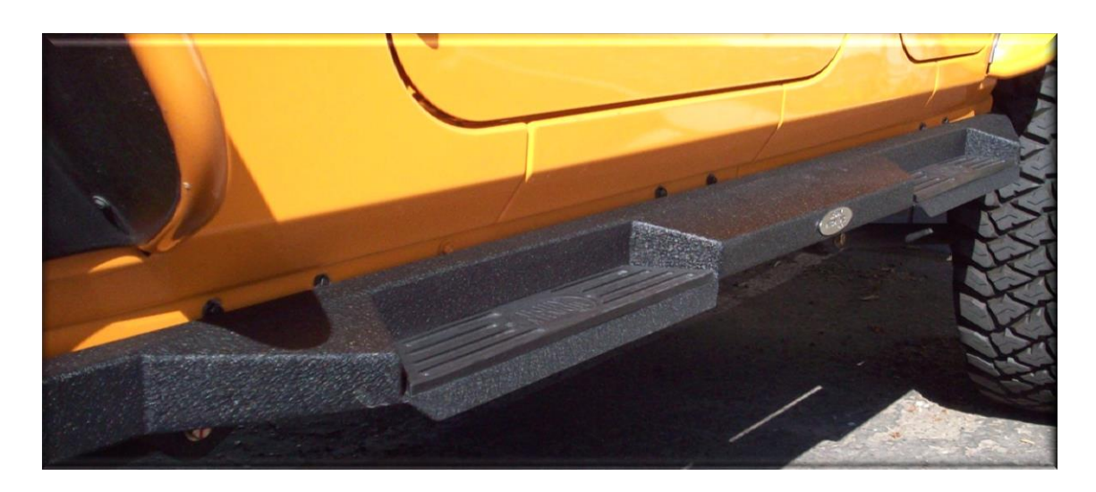
Installation instructions for JK Unlimited PN JK-4123 and JK 2 Door PN JK-4124 Rock Steps

Body Armor 4x4 by Tolar Mfg. 1932 Elise Circle, Corona CA 92879 Ph: 951-808-0750 Customer service hours: 7am to 4:30pm M-TH 8am-12pm Fridays Pacific Time www.bodyarmor4x4.com