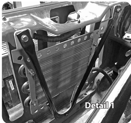
TJ mounted with support brace