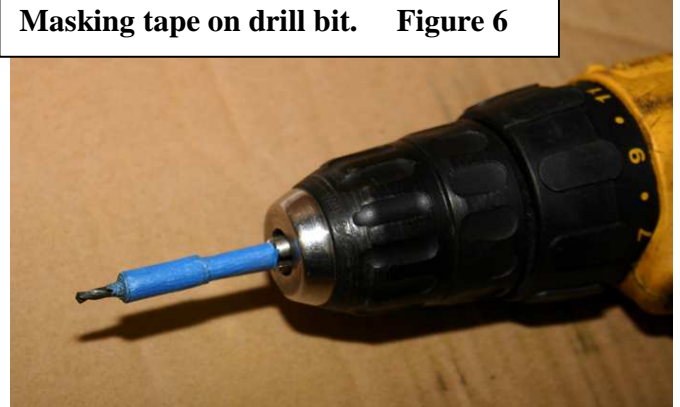
Masking tape on drill bit. Figure 6

5. Using the clip as a reference point, mark and drill two holes with the tape-wrapped drill for the two sheet metal screws. (See Figure 5)