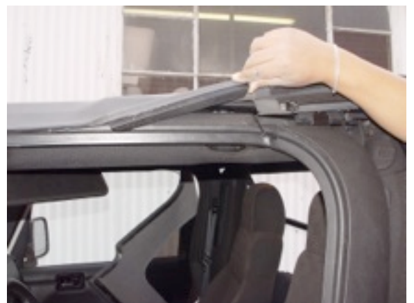
6. Remove side connections to door frame.