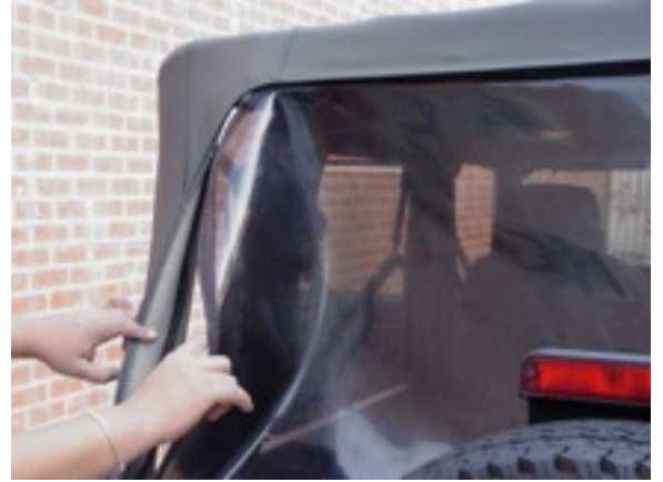
2. Unzip rear window and remove.