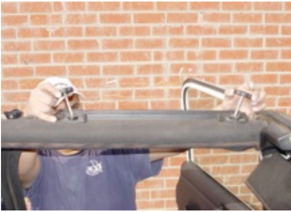
13. Unscrew door pins & remove frames.