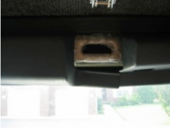
7. Disengage soft top from windshield.