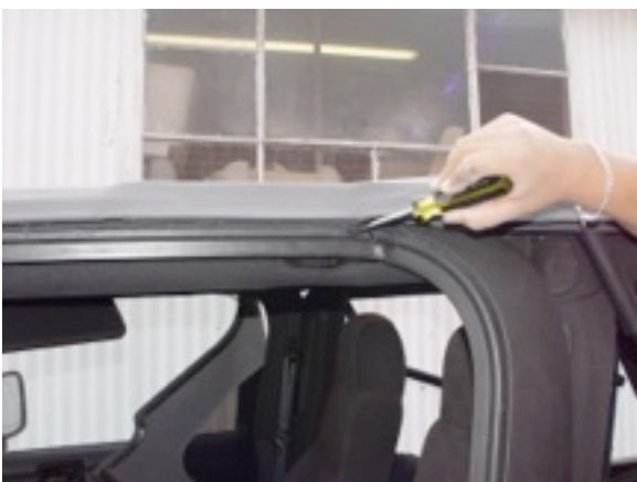
5. Pry open side connections with screwdriver.