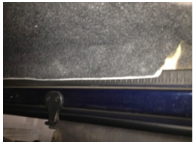
18. Sit in the front seat. Make sure the windshield stop is not hung up on the molding. It should look like this.