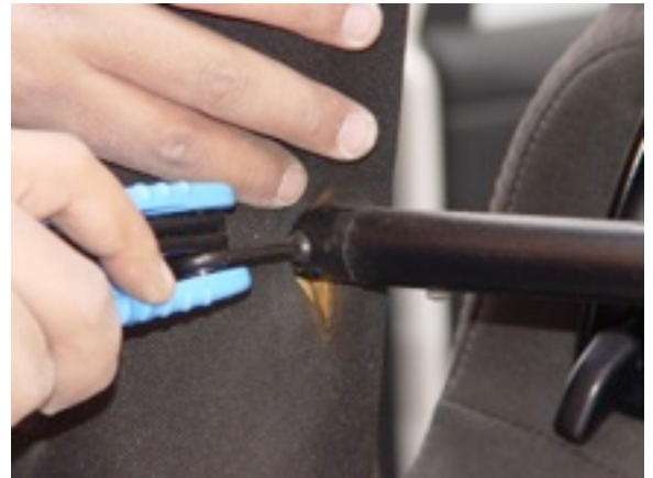
10. Remove bolt from soft top frame.