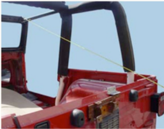
15. See pre-installation instruction sheet.