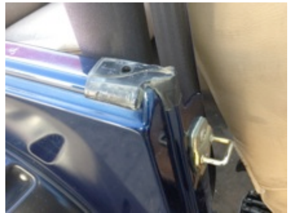
16. Do not remove front corner seal.