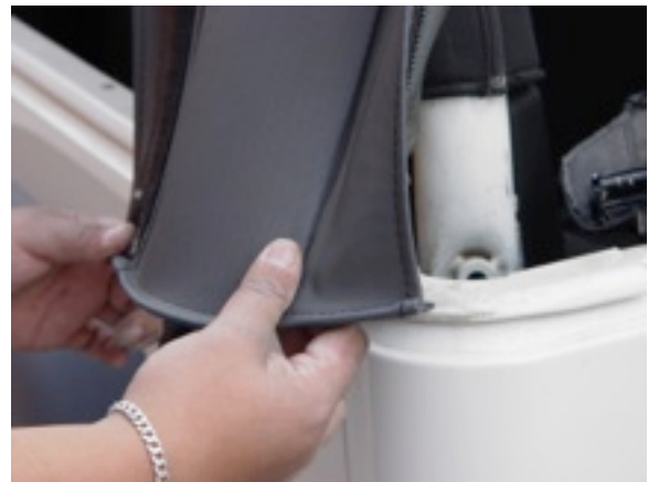
4. Pull down on corners and disengage.