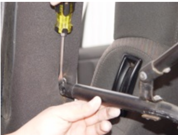
11. Pry off soft top frame from roll bar.