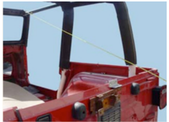
14. See pre-installation instruction sheet.