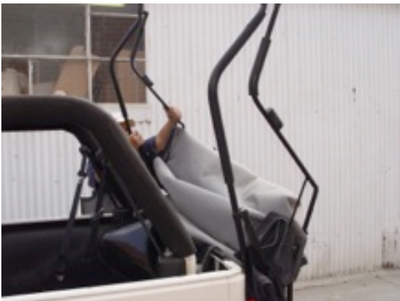
11. Remove soft top.