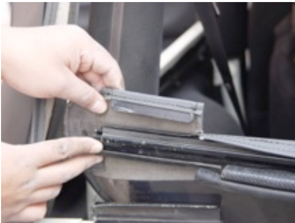
3. Pull back bar to disengage and remove.