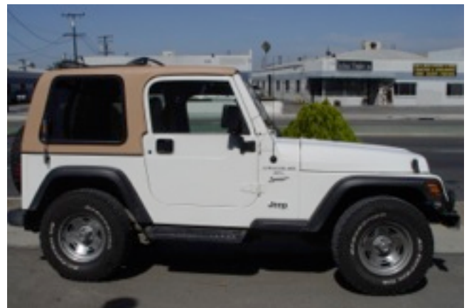
16. Install hardtop on vehicle with at least 2 people.