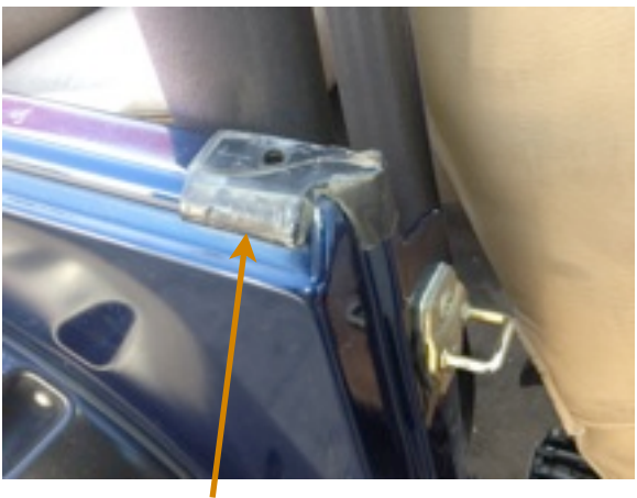
15. Do not remove end seal.