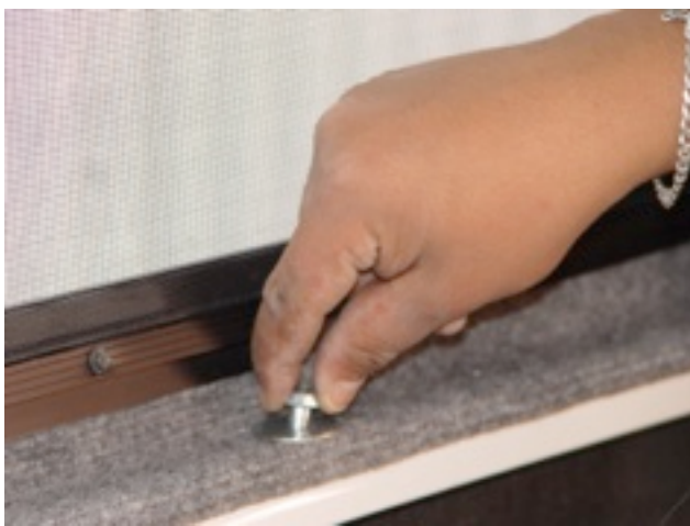
17. Install 6 bolts with washers using nut plates. Adjust the cam locks to medium tension.