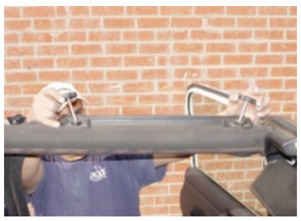
12. Unscrew door pins & remove frames.