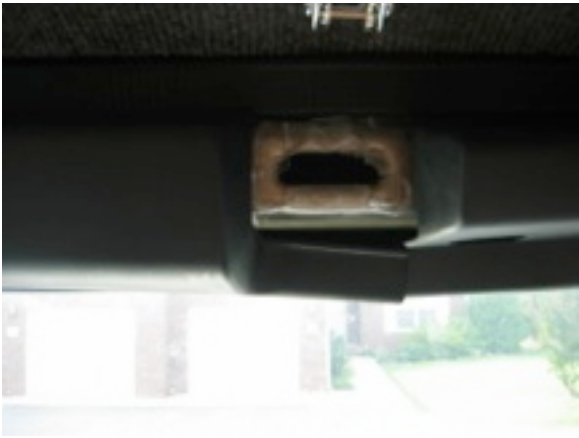
7. Disengage soft top from windshield.