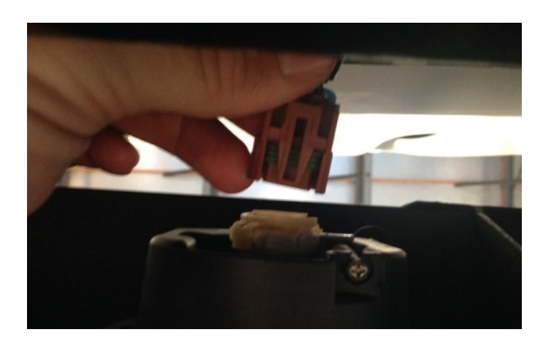
NOTE: For LFS Series bumpers cut the factory fog light harness off and splice the wires coming from your bumper into the factory fog light wiring.

For bumpers with side markers/turn signals—modification is needed and can be spliced into the factory signal wire harness and if the lighter is used they should be wired to the battery with a switch in between.