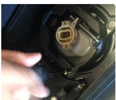
STEP 6: Line up the light housing to the tabs on your new bumper as shown and use plastic fasteners, zip ties or bolt hardware (not supplied) through from the opposite side so the fastener is coming towards you and tighten down.